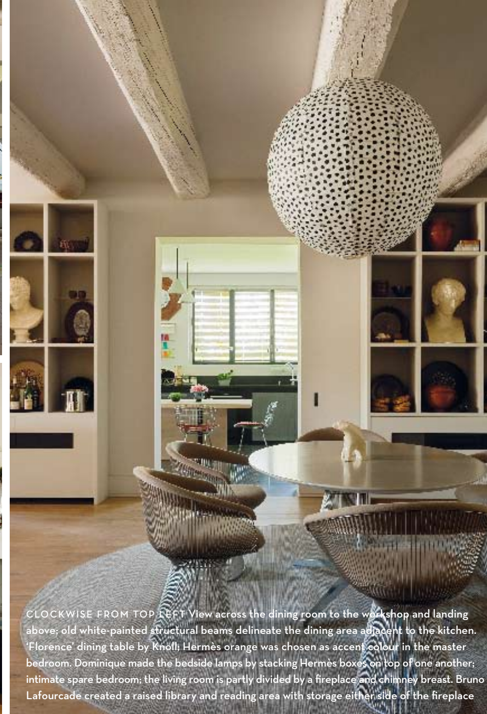
CLOCKWISE FROM TOP LEFT View across the dining room to the workshop and landing above; old white-painted structural beams delineate the dining area adjacent to the kitchen. 'Florence' dining table by Knoll; Hermès orange was chosen as accent colour in the master bedroom. Dominique made the bedside lamps by stacking Hermès boxes on top of one another; intimate spare bedroom; the living room is partly divided by a fireplace and chimney breast. Bruno Lafourcade created a raised library and reading area with storage either side of the fireplace