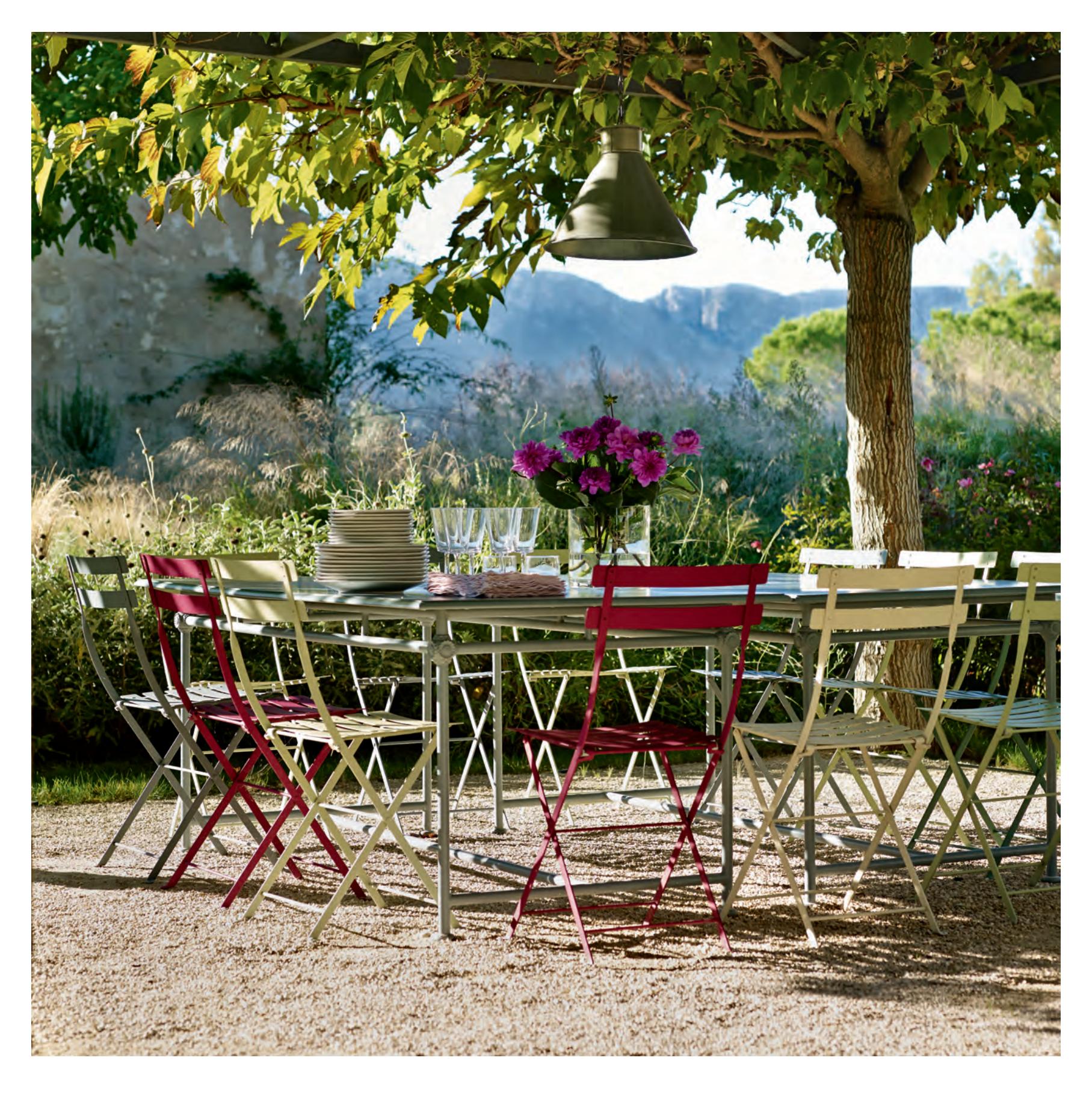
Removing a derelict outbuilding has opened up views across the rugged Provençal landscape.